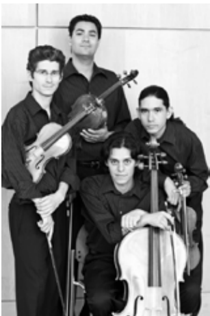
La Catrina Quartet July 19th