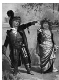
Shakespeare's Taming of the Shrew September 13th

Comedy of the sexes performed by the Sonoma County Repertory Theatre