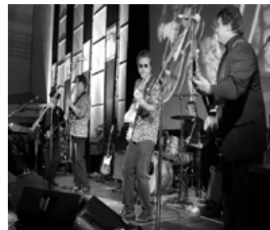
Sun Kings - Acoustic September 12th A fun evening with of Beatles hits just the way you remembered them